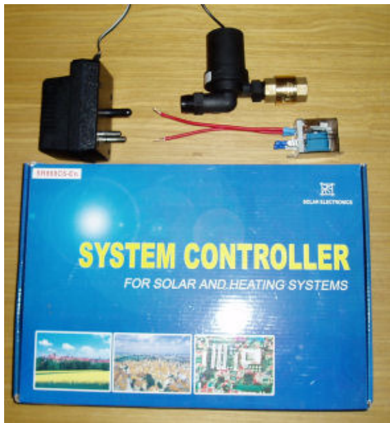
Fig 1. Pump with non return valve connected, SR868C6-12V controller, geyser element relay and power supply.