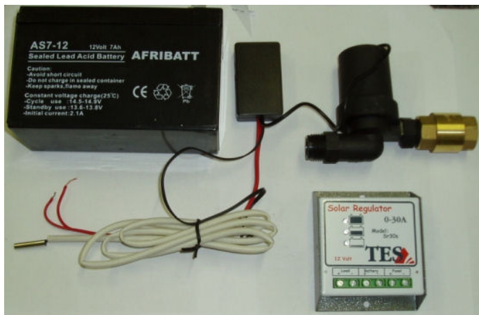
Fig 1. Pump with non return valve connected, 1Sense controller, charge controller and battery