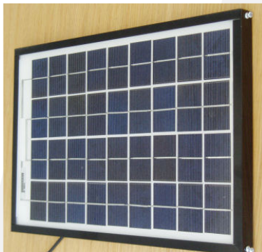
Fig 2. 10W PV panel