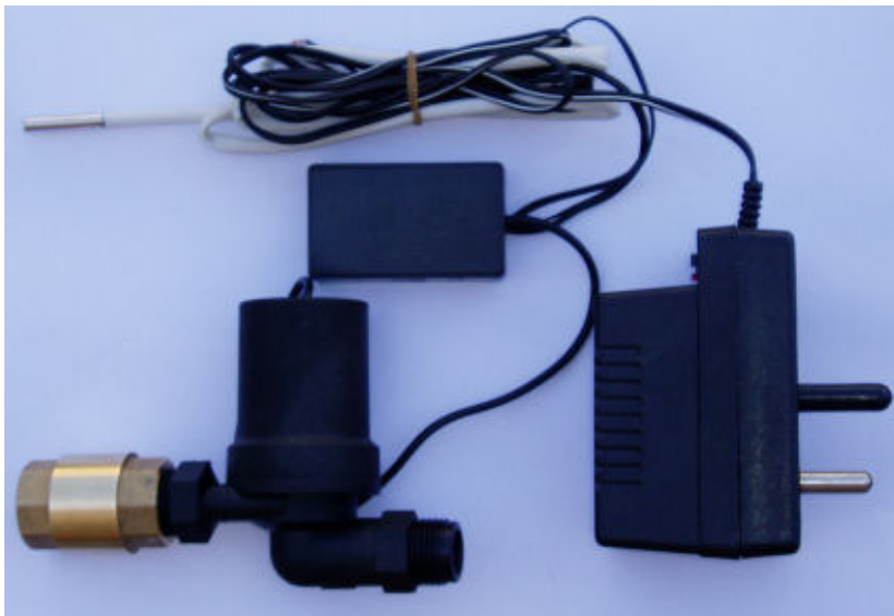
Fig 1. Pump with non return valve connected, 1Sense controller and power supply