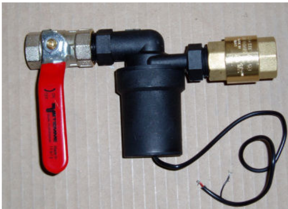
Fig 1. Pump with lever ball valve and non return valve connected